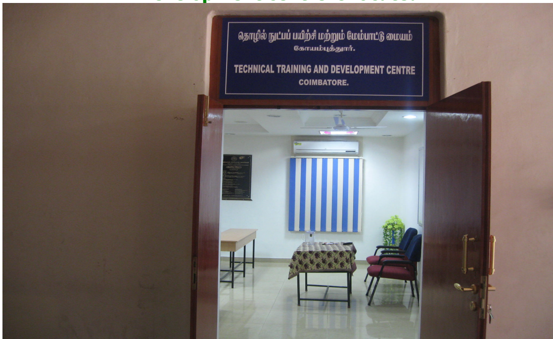
Entrance view of the Training hall