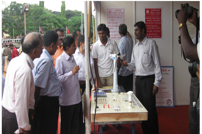
Energy Conservation Exhibition