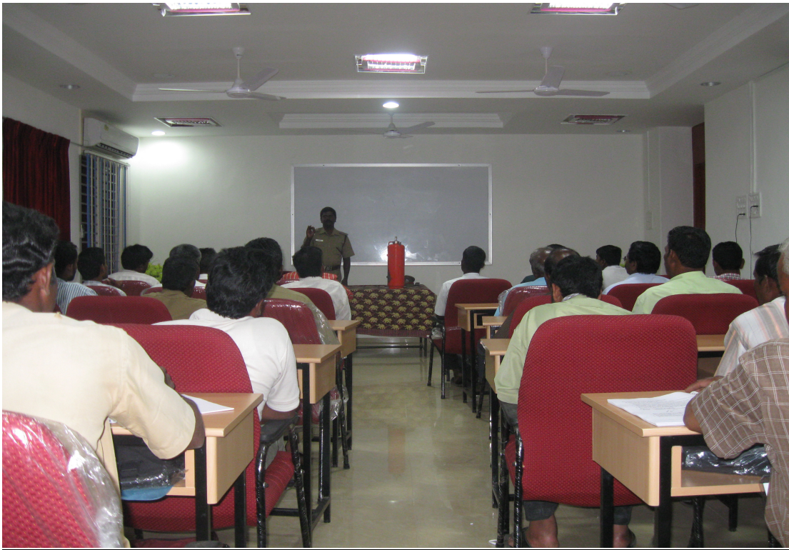
Trainees during a training session