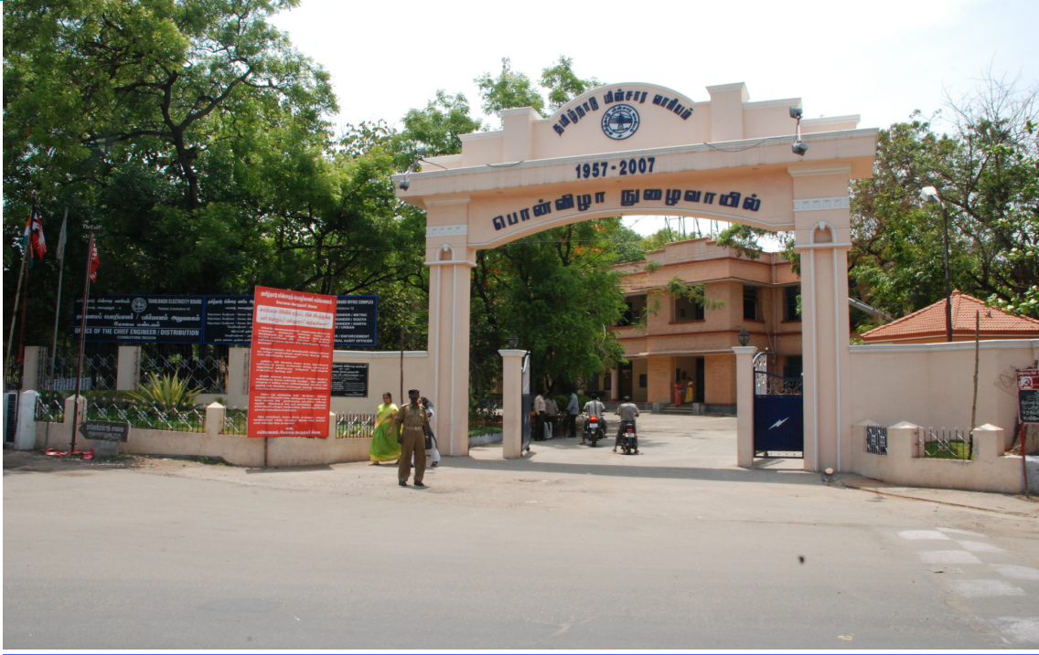
Front view of the entrance to the premises in which Technical Training and Development centre is located